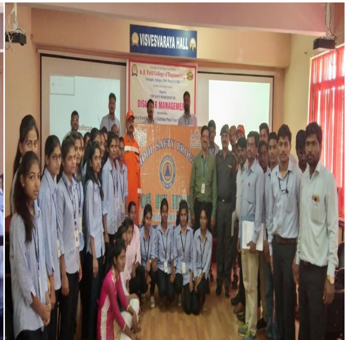
Workshop participants along with NDRF Team

We would like to thank BSW,SPPU ,Pune and our Management, Principal for their support and continuous encouragement to organize this event. This is for your information please.